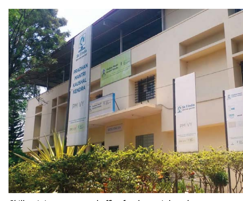
Skill training centre and office for the social work