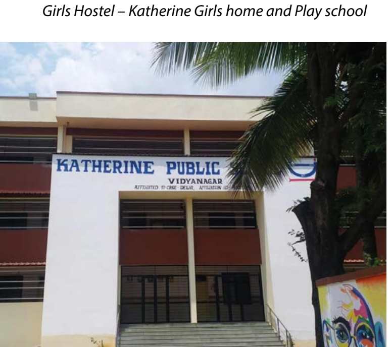
Katherine Public school