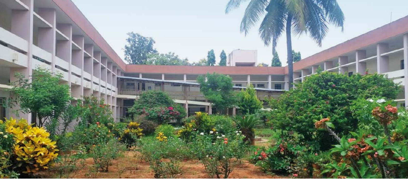
Inner courtyard of senior citizens home and sisters residence