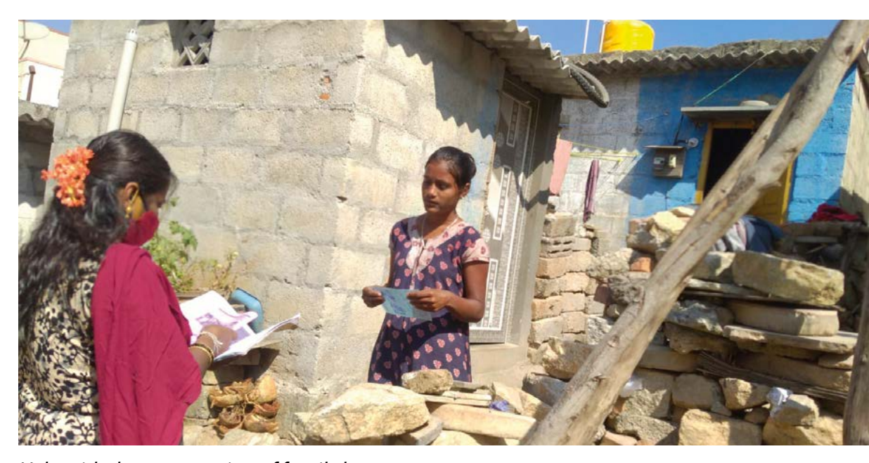
Help with the construction of family houses