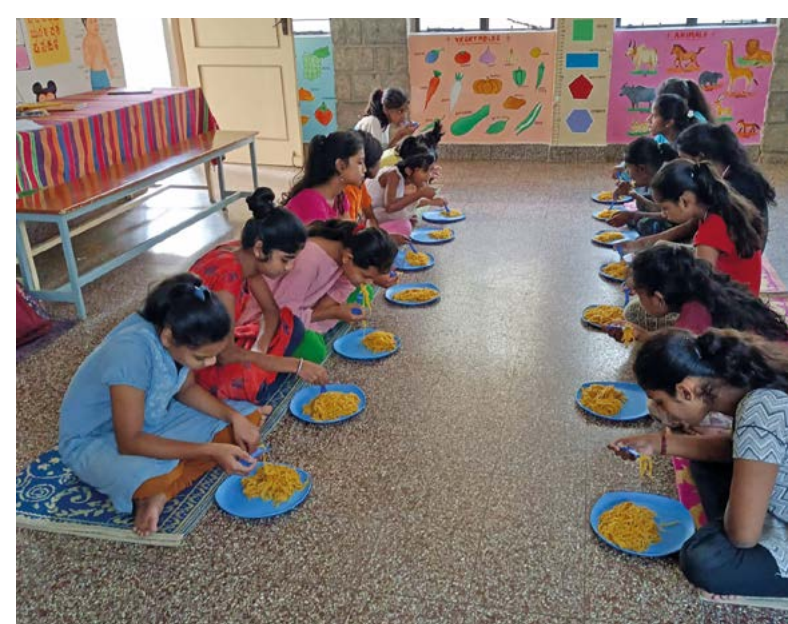
Lunch at school